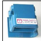
Right locking piece