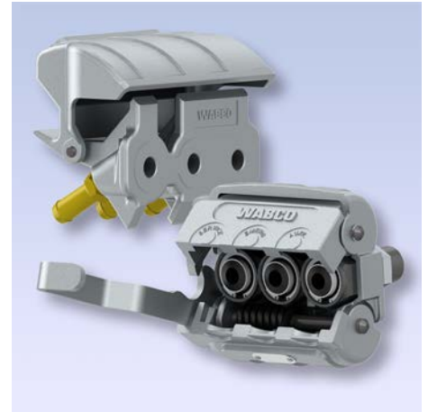
New WABCO TrioMatic couplings