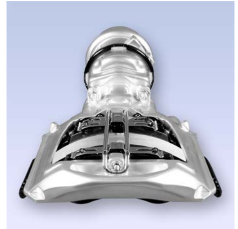
Air disc brake MAXX™22T

For that reason please attach a visible warning note on the steering wheel when working on the brake system.