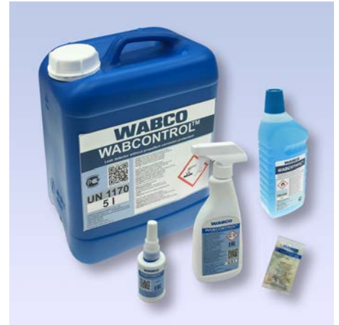
WABCO chemical products with new labels

A small investment in the right maintenance product can make a huge difference to the service life and long term maintenance costs of the vehicle.