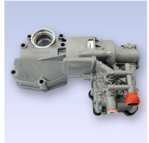
WABCO Gear shift cylinder 421 350 087 0, 421 350 088 3

In addition to its existing portfolio, WABCO supplies two variants of gear shift cylinders and seven related repair kits for the heavy duty range of Daimler and FUSO vehicle applications for the independent aftermarket (IAM).