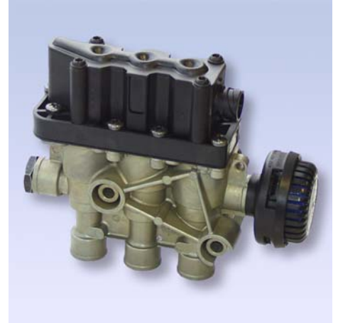
ECAS3 solenoid valve 472 880 xxx 0