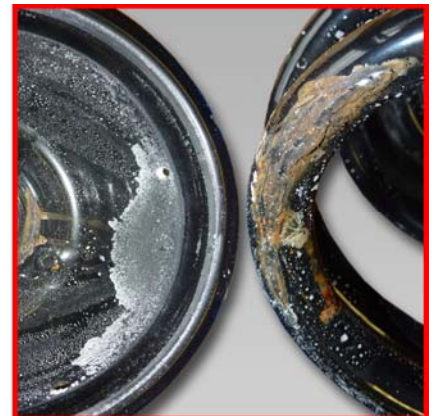
clear visible corrosion