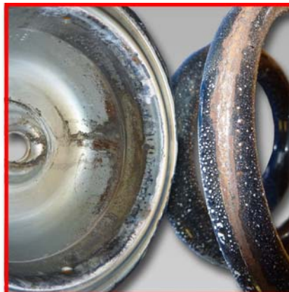
clear visible corrosion