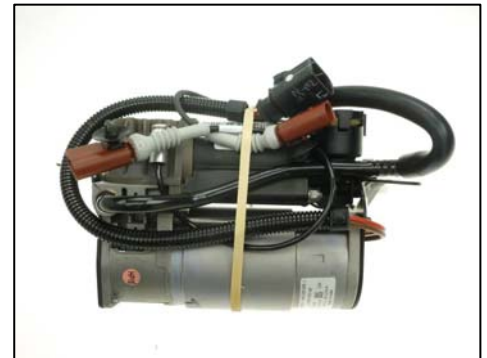
Car compressor aggregat for Audi A8

The compressor is the heart and main component of an Air Supply Unit (ASU). Generally, original equipment suppliers offer the complete Air Supply Unit as a replacement in the event of a repair. WABCO provides an alternative and more economical repair solution to its customers: the compressor can be replaced separately without replacing the complete Air Supply Unit.