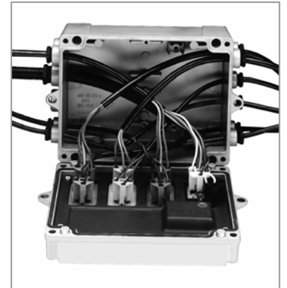
Figure: Vario C

In the following sections we offer a comparative description the old solution and the new one.