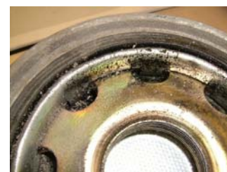
Figure 2: Air System Protector with coa- lescing filter after 60.000 km