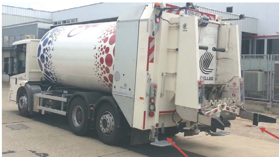
USS Level 1

The specific position of the individual sensors can be read out in the Diagnostic software after opening the ecu file.