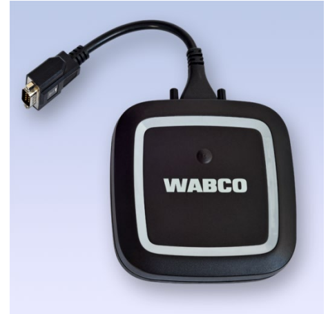
WABCO Diagnostic Interface 3